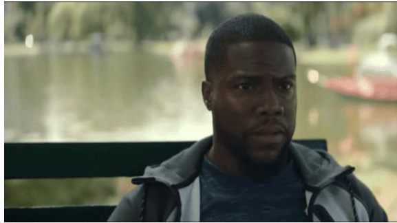
Figure 7. Scene 0.27.21

Which will be shown in the dialogue below: