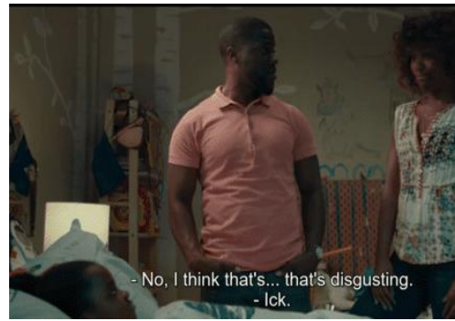
Figure 6. 01.10.08