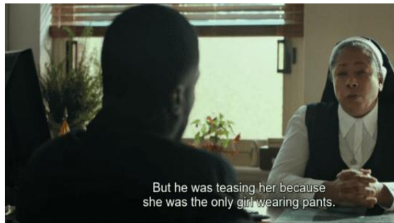
Figure 17. Scene 0.55.34

Which will be shown in the dialogue below: