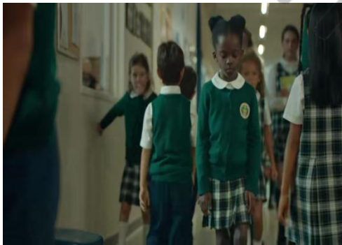
Figure 11. Scene 01.12.08