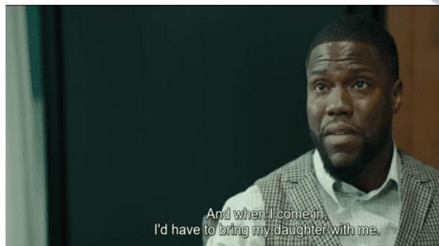
Figure 2. Scene 0.18.55