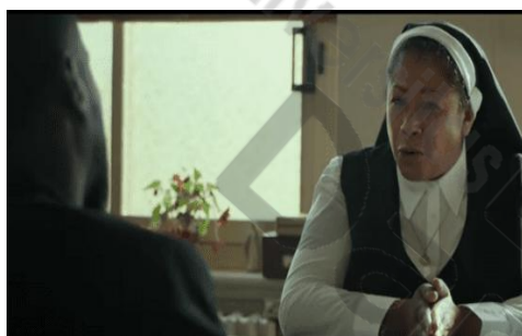
Figure 22. Scene 0.54.23

Permissive parenting According to Baumrind (1991) explains that permissive parents attempt to behave in an acceptant, affirmative, and non-punitive manner toward their children's encouragements, actions, and desires. Little or no manipulation over the kids behavior is applied by permissive parents.