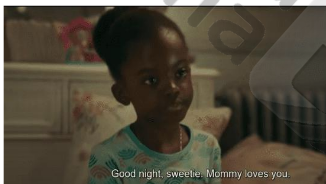
Figure 14. Scene 01.04.05

Which will be shown in the dialogue below: