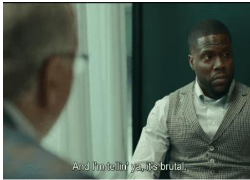
Figure 5. Scene 0.19.51