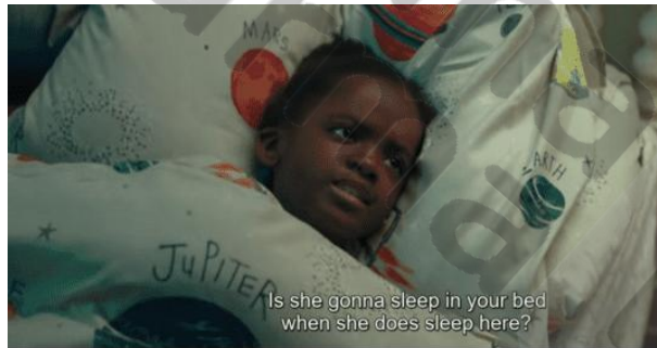
Figure 16. Scene 01.09.51

Which will be shown in the dialogue below: