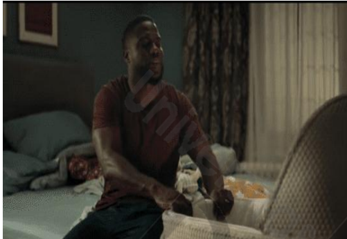
Figure 18. Scene 0.23.09

Authoritative parenting is a parenting style where open communication and natural consequences, reasoning and figuring to toughen aims are encouraged.