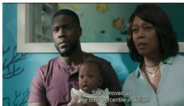
Figure 8. Scene 0.42.08

The fourth characterization of Matthew Logelin that had been found as characterization of external action was categorized based on M. Boggs and W. Petrie (2008), wherein character characteristics can be fashioned through the