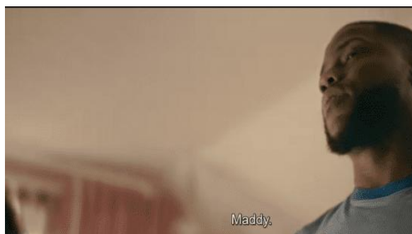
Figure 13. Scene 01.22.26

There is a method used to explain the characterization that is evidenced in the selection of character names. This method is also based on the theory by M. Boggs and W. Petrie (2008) that the researcher used in this study that the characteristic choice of name can be formed using names, meanings, sounds, and also appropriate connotations can be important to categorize a character.