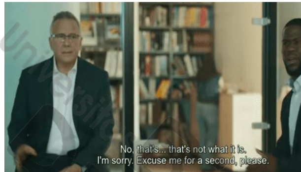
Figure 9. Scene 00.36.20

Which will be shown in the dialogue below: