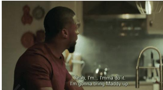
Figure 1. Scene 0.16.31

Which will be shown in the dialogue below: