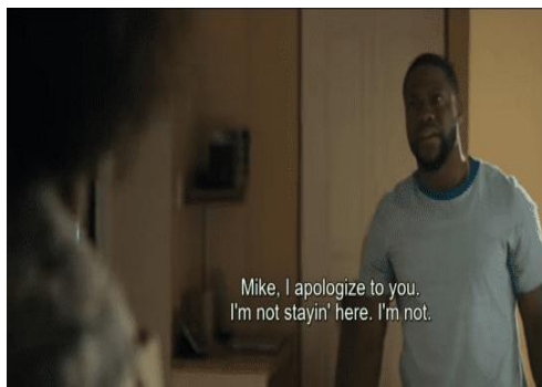
Figure 20. Scene 01.21.59

The authoritarian parenting style tries to verify, adjust and command the children's attitudes and behaviors that are organized with prepared requirements of conduct, known as the autocratic standard.