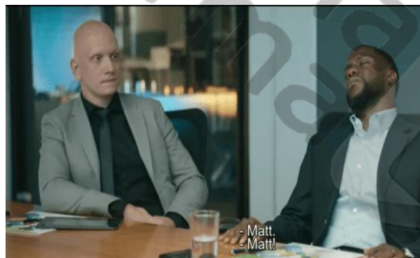
Figure 6. Scene 35.40

The second method of characterization of Matthew Logelin is also based on the theory by M. Boggs and W. Petrie (2008) that the researcher used in this study, in which the characteristic choice of name can be formed using names, meanings, sounds, and also appropriate connotations that can be important to categorize a character.